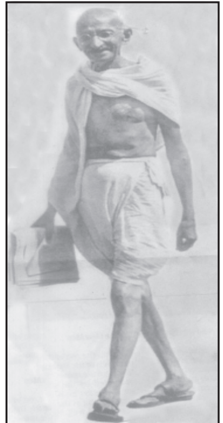
Gandhiji said "If I were the dictator for one hour, I will close all liquor shops without paying compensation"

It is gratifying that so many students have expressed their disgust about the fast spreading liquor consumption in Tamil Nadu, disproving the general view that prohibition has lost the battle in the state. Students said that the media and cinema are spreading a false image that most of the youth and several women take